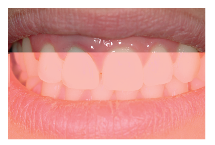
Figure 3. Preoperative photograph. Note high lip line and discoloration of fractured maxillary right central incisor.

amount of stress<sup>7,10,13</sup> on prostheses and the surrounding bone than that associated with straight abutments. However, survival studies did not demonstrate a significant decrease in prosthesis longevity when angled abutments were used.<sup>13,14</sup> Furthermore, there was no additional bone loss adjacent to implants that supported angled abutments<sup>15</sup> compared with straight abutments, and angled abutments did not lead to an increased incidence of screw loosening.<sup>13,14,16</sup>