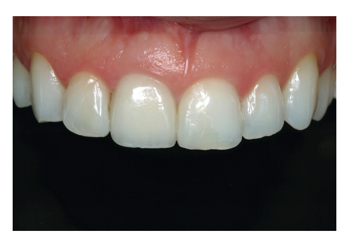
Figure 6. Postoperative view of restoration.

Su et al<sup>22</sup> described the importance of soft tissue esthetics in relation to the emergence profile. This profile is largely determined by the soft tissues forming around the interim restoration. This submucosal contour can be provided to the dental technician so that it can be predictably replicated on the definitive restoration.