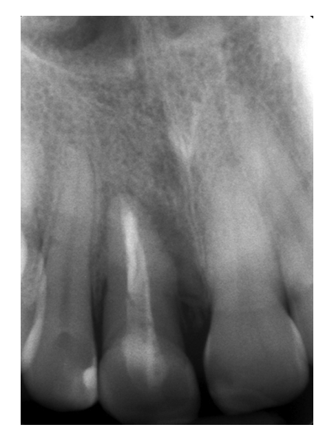
Figure 4. Preoperative radiograph showing fracture of right maxillary central incisor.

This abutment is made to be compatible with the following implant systems: Straumann, Dentsply Astra Tech, Nobel Biocare (Brånemark system, Replace, Standard and Multiunit abutments), Biomet 3i, BTI, Phibo